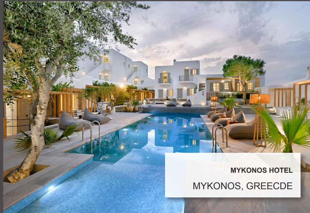
MYKONOS HOTEL MYKONOS, GREECE