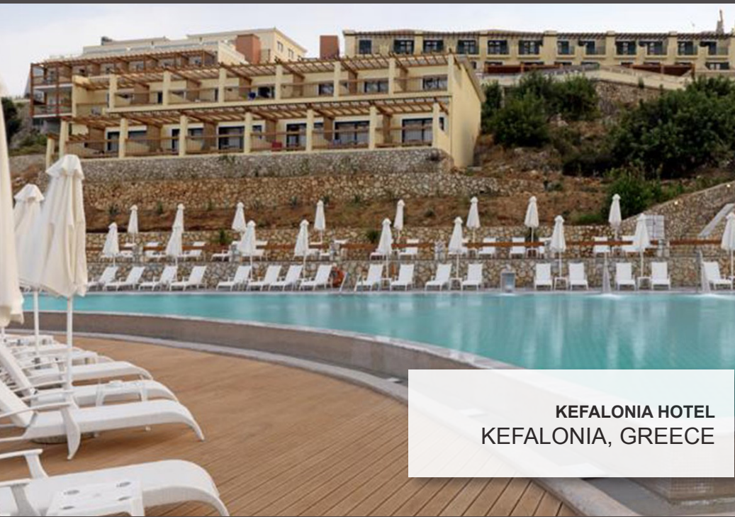
KEFALONIA HOTEL KEFALONIA, GREECE