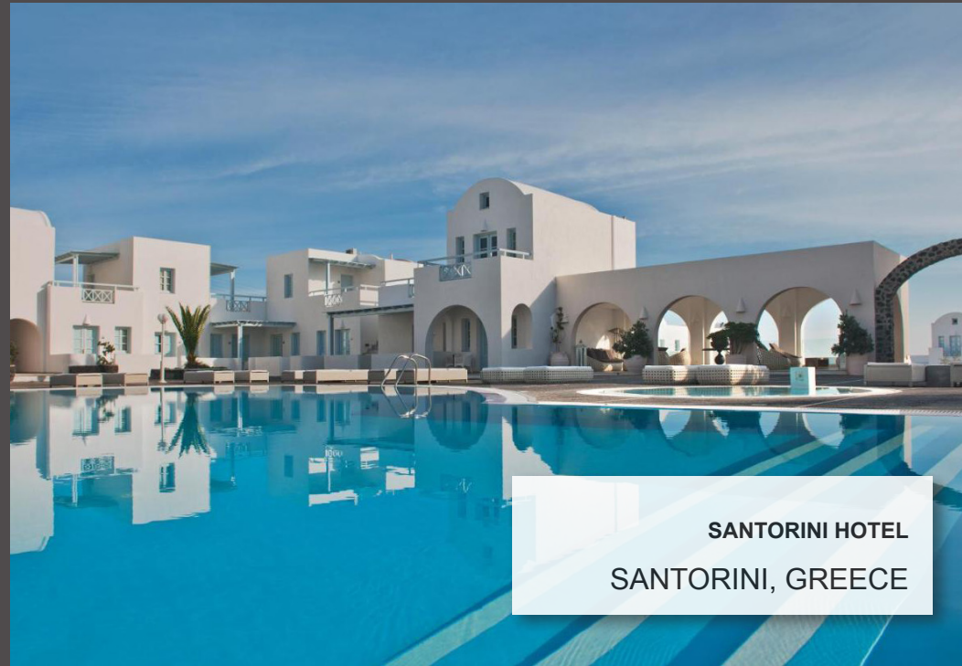
SANTORINI HOTEL SANTORINI, GREECE