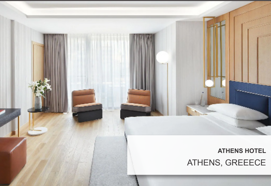
ATHENS HOTEL ATHENS, GREECE